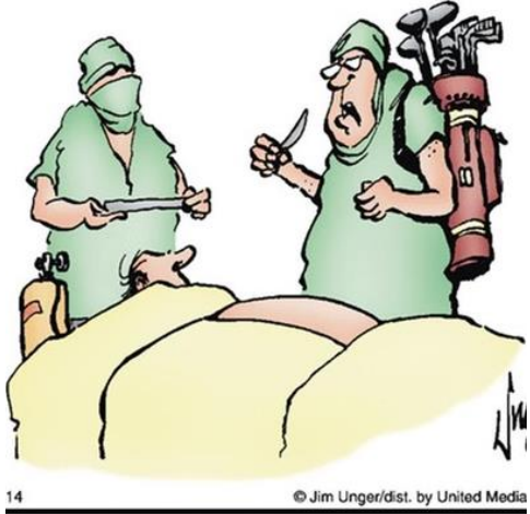
14 © Jim Unger/dist. by United Media